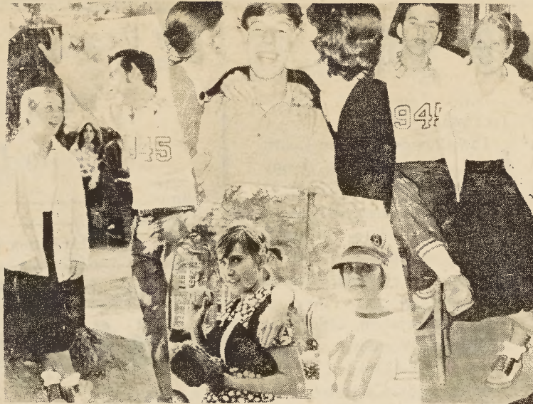
Whirlie spirit shines on as students display their support for GHS.

We love you...Dick and Lois...Nut...Nurd....Dick!