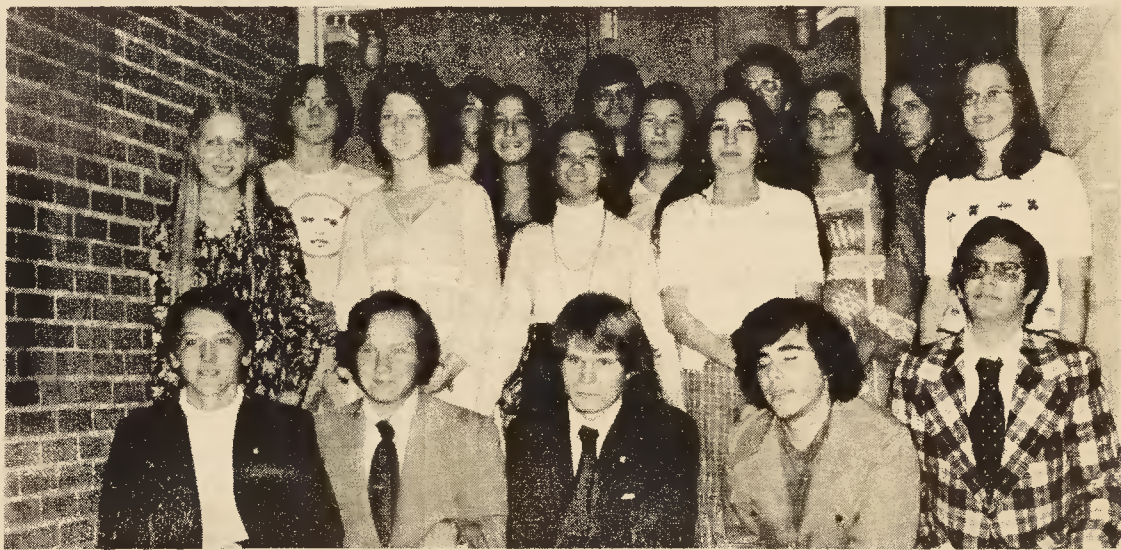
Quill and Scroll honors these students for their journalistic ability.