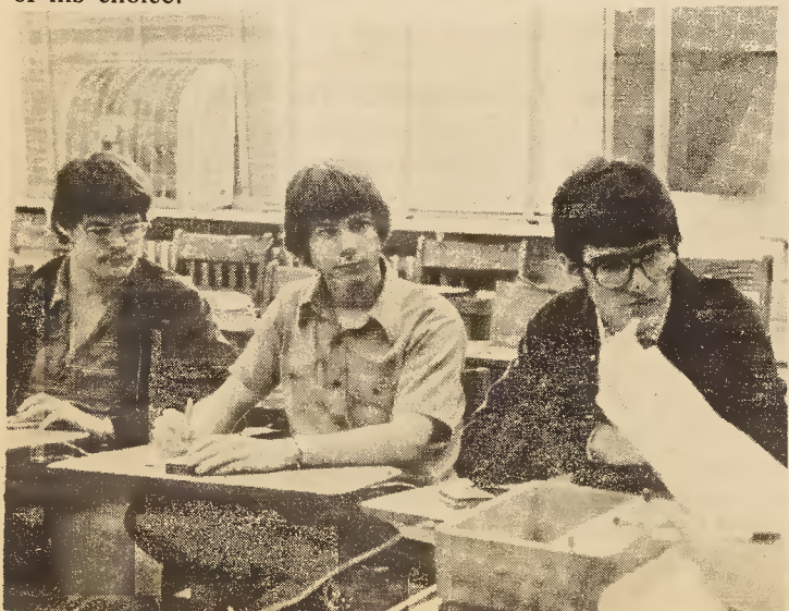
Three High I.Q.'ers practice.