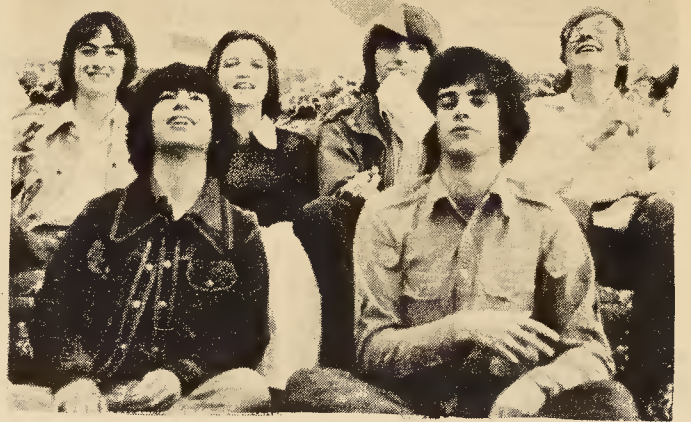
Grimsley's Debators show organization.

The debaters are planning to have a scrimmage match with Smith High School on March 12, and a city championship tournament is set for May 3 at Dudley.