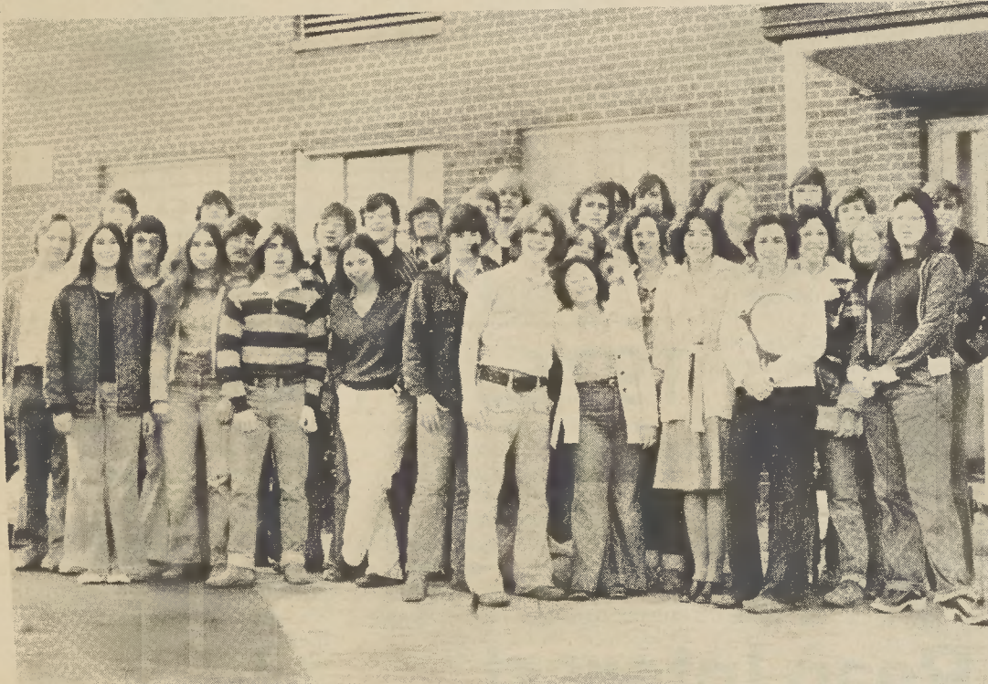
Thirty eight Grimsley musicians have been selected for the 1976 All-State Band.