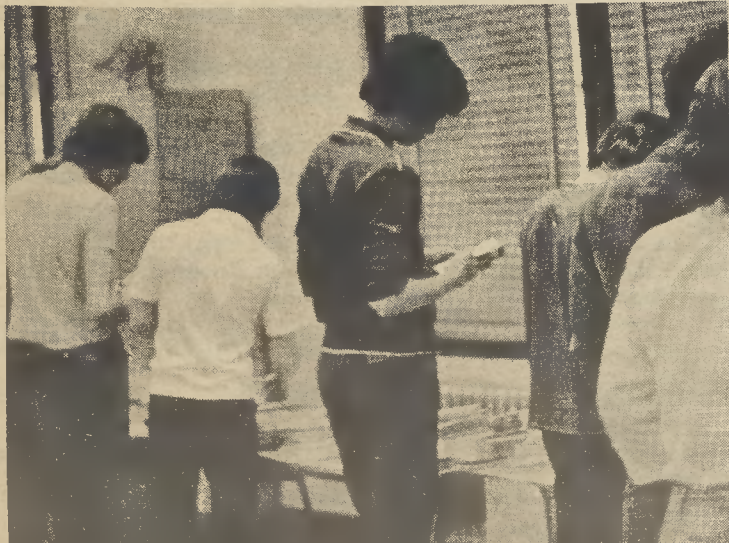
Students ponder literary selections at Book Fair.

Next year's school calendar will be chosen at the March meeting of the School Board.