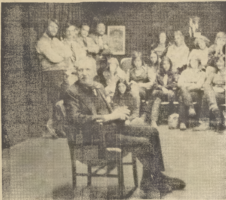
Vincent Price speaks to drama students in Grimsley's studio theatre.

From 1930 until 1965, Mr. Price feels that there was a "great