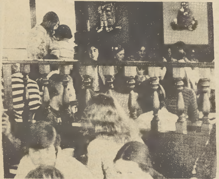
Students crowd McDonald's at lunch.