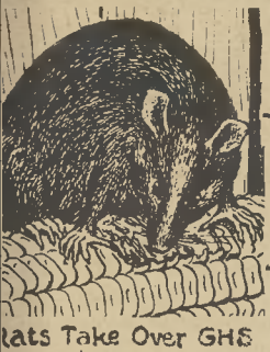
Rats Take Over GHS