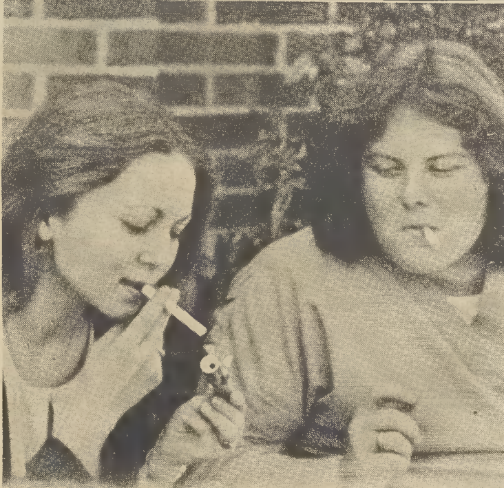
This healthy chalk "smoker" enjoys company with a group of cigarette smokers.

The calcium found in chalk is the same kind that is found in milk, cheese, and ice cream. It is essential for strong teeth and bones. The expression, "Chalk in time can save your spine," is expected to be a national motto for high school age students. If the minimum daily requirement for calcium is not met the body itself will seek out any source of the mineral. Breaks between classes are ideal times for the calcium hunters to find the calcium and then pig out on it. This is when the largest amount of chalk is stolen from the classrooms.