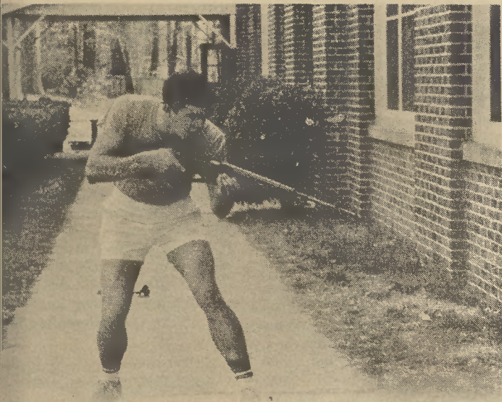
Grimsley's ROTC goes after the mice which have recently caused disruption in several classes.