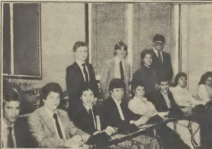
Sophomore and junior team members