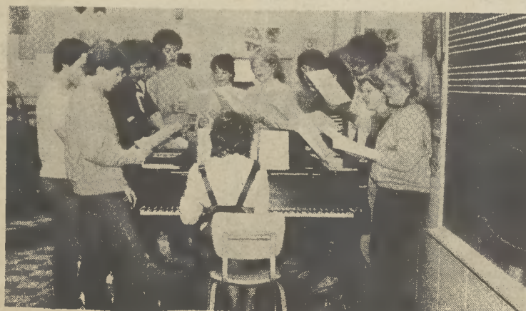
The mixed choir department members practice for Challenge

Grimsley's jazz band is going to a contest sponsored by and held at UNC-Chapel Hill. The jazz band attended the same contest last school year and received a superioir rating.