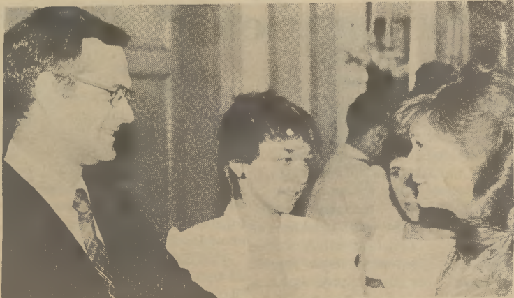
Seniors enjoy elegant atmosphere of The Senior Tea.

The Senior Tea is always a special affair that everyone who attended will always remember. It is definitely one of the biggest events held for the graduating class.