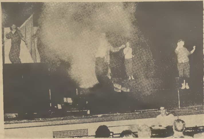
Senior 'Spectacular' gives a look at the future.

Thursday was like any other at Grimsley. Lots of good-looking people and clothes, talk of the weekend, and all of the students in the gym. Yes, this Thursday was the beginning of Class Olympics.