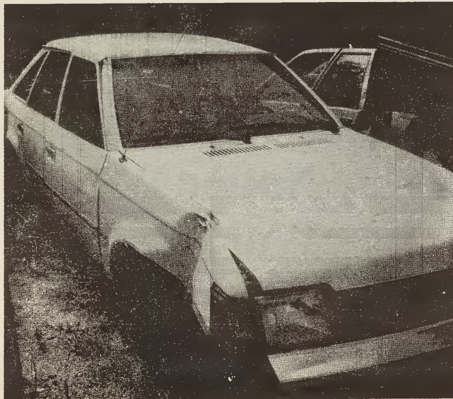
Grimsley student's car sits in lot after an accident.