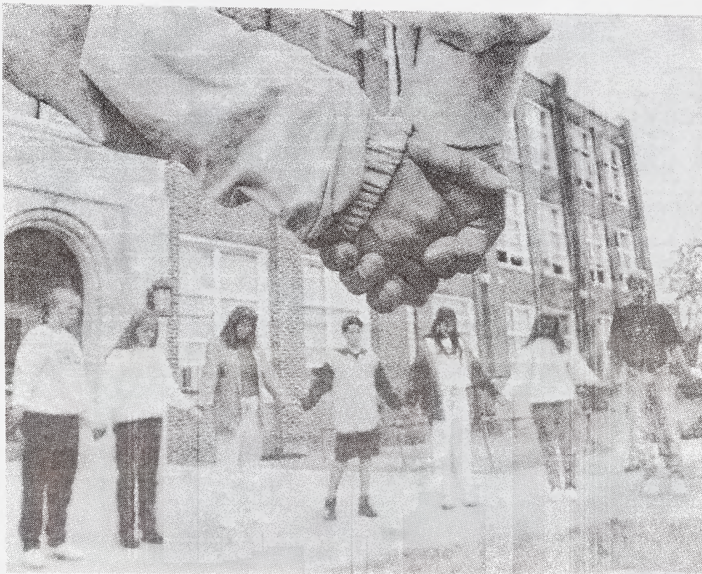
Students gather around the flagpole for a prayer session on September 21.

"See You At the Flagpole" an annual, na-