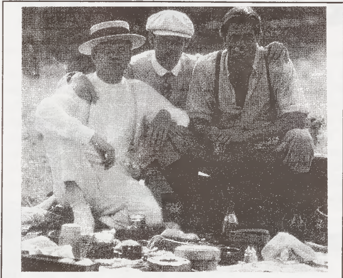
Quinn, Thomas, & Pitt play the three brothers.

All of the characters in the movie, including Tristan, seem removed and lonely. The things each loves the