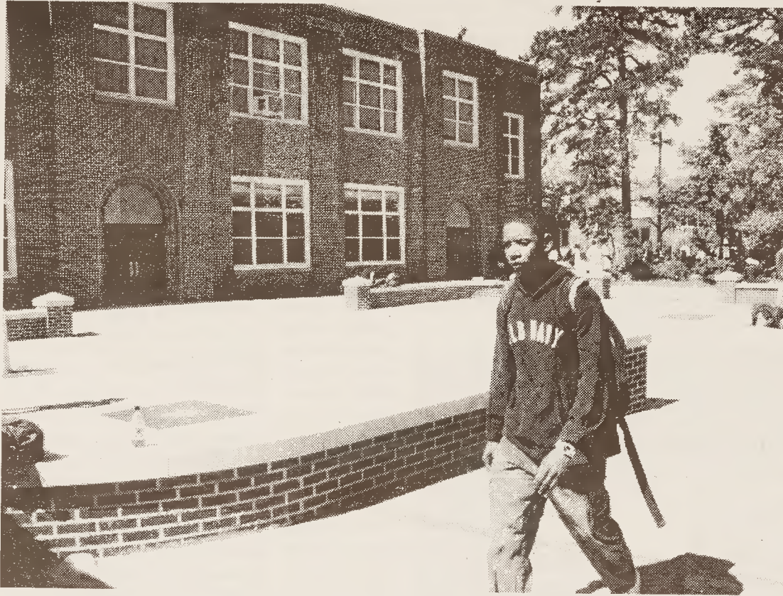
The new concrete seating area, completed at the end of September, provides extra seating for students at lunchtime. New picnic tables are scheduled to be added soon to provide even more space to eat.

A newly renovated cement seating area, the addition to the grove was originally designed to eliminate flooding that occurred repeatedly in Mr. Zaruba's classroom under the auditorium.