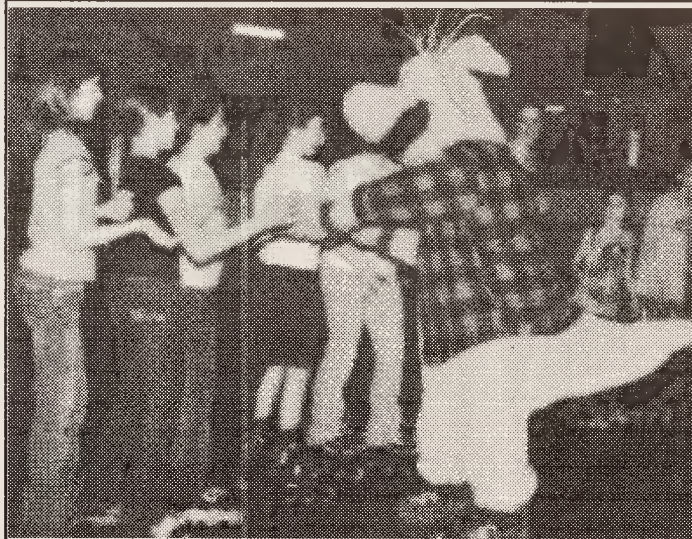
Dr. Pepper photos

Admission is free but limited to Grimsley seniors.