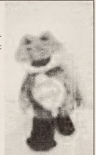
Drake the dinosaur and Fanny the frog, shown above, are lovable mascots that get the party and skating started. The pair will perform a skate routine at this year's "Senior Skatenight."