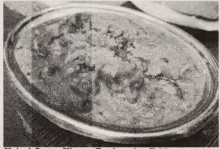
United States History Teachers in all 50 states are now required to teach the histoy of Mongolia as part of the curriculum.

Management from the Greensboro Coliseum was looking to expand their site and purchased the property where the mall currently stands. Therefore, all of the consumers who shop at Four