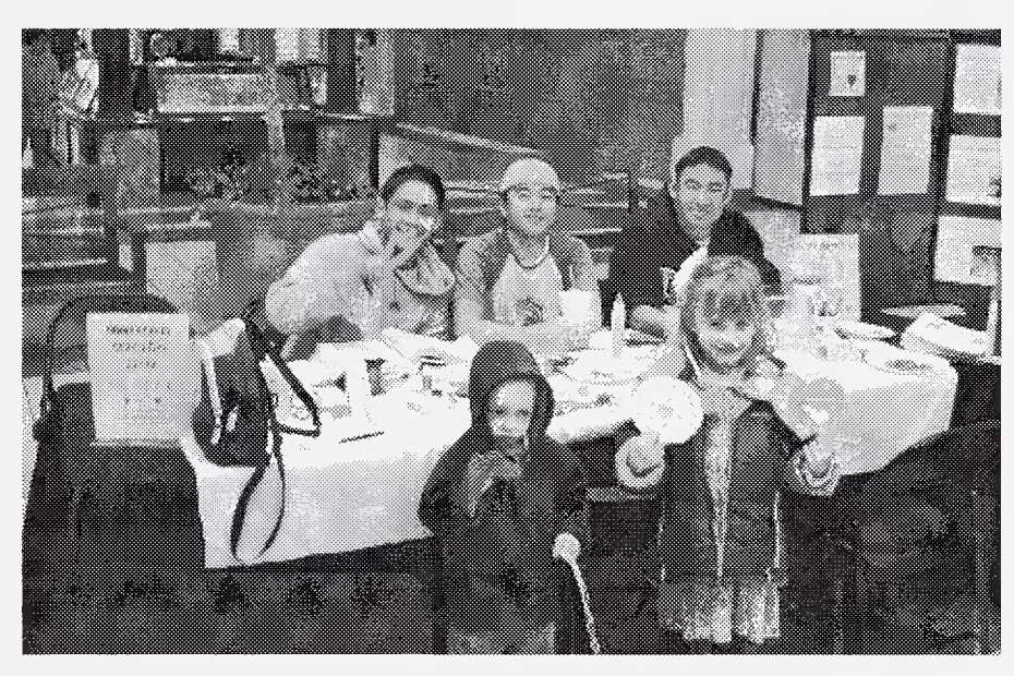
Members volunteering during Valentine's Day.

looks on to make more steps in addressing Asian issues and promoting awareness.