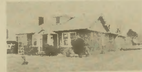
2320 GREENWAY AVENUE - Living Room, Dining Room, Kitchen, 3 bedrooms, large den. Remodeled with new kitchen cabinets. Redecorated. $58,500.

100 S. Marshall St. Winston-Salem, N.C. 919/722-1137