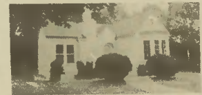
312 FOREST HILLS OFF INDIANA AVE. Remodeled Living Room, Kit. with breakfast area, Dining Rd., 2 bdm., $49,500. FHA VA, NC Housing Money.