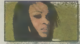
Karen Clark Sheard

Cruise does not include airfare, tips, tour excursions or personal expenditures. CRUISES FOR CAUSES IS THE EXCLUSIVE TRAVEL MANAGEMENT COMPANY FOR THIS CRUISE. YOU WILL NOT BE ABLE TO BUY THIS PACKAGE THROUGH ANY OTHER AGENT OR TRAVEL MANAGEMENT COMPANY.