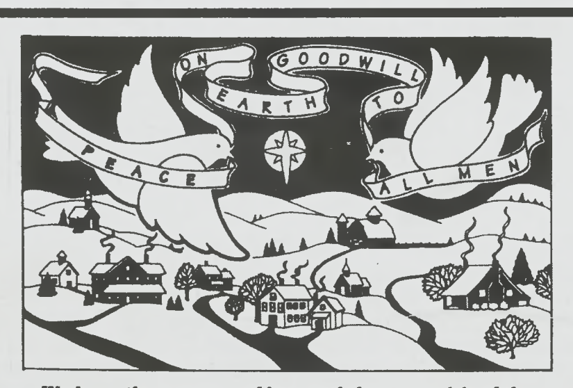
We hope the message of love and the true spirit of the season makes its way into each heart in every land.

In Women Risk Takers, I unfold the paradox and the enigma of kingdom submission, which is very cryptic or coded. True liberation comes only through submission. You must get the book to discover the mystery. One of the greatest discoveries I marveled was when I found in scriptures the persons God used to introduce the concept of submission