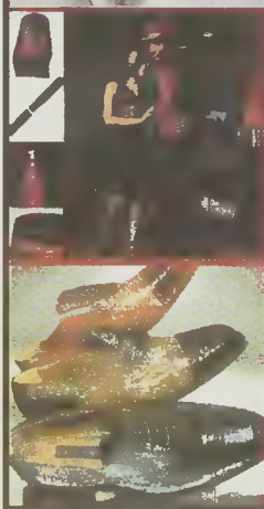
Fine Menswear, Footwear & Accessories

You will like our look, and so will your wallet.