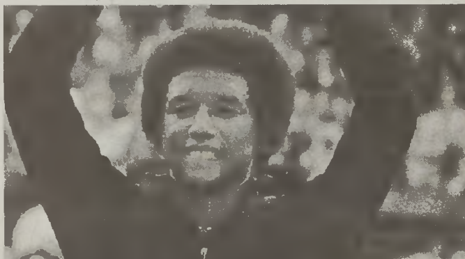
Arthur Ashe (July 10, 1943 – February 6, 1993)

Choreographer Alvin Ailey is renowned for popularizing modern dance through his world-famous company, the Alvin Ailey American Dance Theater. He passed away from AIDS-related diseases at 58.