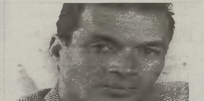
Franklyn Seales (July 15, 1952 – May 14, 1990)

Better known simply as Sylvester, this disco star released the dance classic "You Make Me Feel (Mighty Real)" in 1978. He passed away due to complications from AIDS at 41.