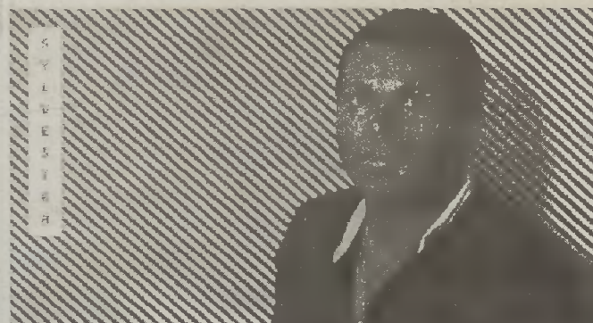
Sylvester James (September 6, 1947 – December 16, 1988)

Rollins made a name for himself in memorable roles such as Coalhouse Walker, Jr. in the 1981 film Ragtime. After struggling with substance abuse, Rollins died of AIDS-related lymphoma at 46.