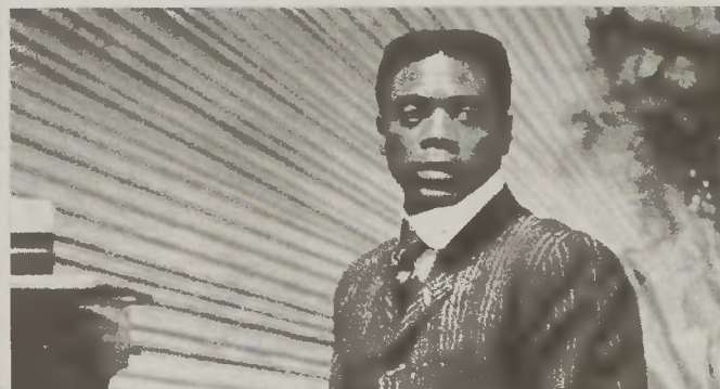
Howard Rollins (October 17, 1950 – December 8, 1996)

Robinson became the first black national news anchor in America as the co-anchor of ABC Nightly News. He succumbed to AIDS-related complications at 49.