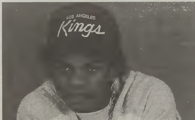
Eazy-E (September 7, 1963 – March 26, 1995)

Arthur Ashe was the first African-American man to reach prominence as a professional tennis player. After contracting AIDS from a blood transfusion in the '80s, he became an activist to raise awareness about the disease. He died at 49.