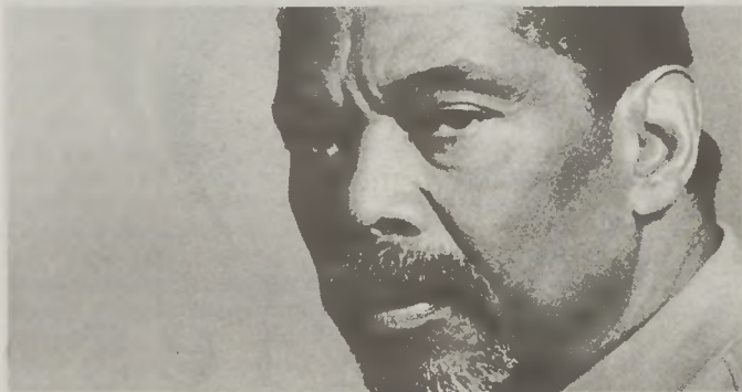
Alvin Ailey (January 5, 1931 – December 1, 1989)

Many high-profile celebrities have lived and died with the HIV/AIDS as well. The loss of these stars should serve as a reminder of what our community will continue to lose if we don't educate ourselves, change our behaviors, get tested regularly and get treated to prevent and fight against HIV...which many people forget is very much a preventable disease.