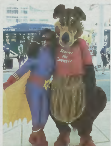
Triad Commute Challenge Mascots- Scooter the Commuter & Air Avenger

Persons wishing to pledge to take the Challenge can do so by returning the pledge form found in this publication, visiting www.triadcommutechallenge.com or by calling 336-291-4321.