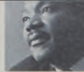
Dr. M. L. King