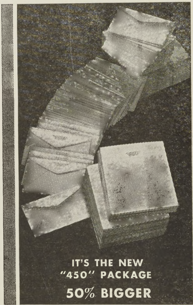
IT'S THE NEW "450" PACKAGE 50% BIGGER

Send one dollar—check, bill or money order ($1.10 west of Denver and outside of U. S.). Your package will be printed and mailed within 3 days of the receipt of your