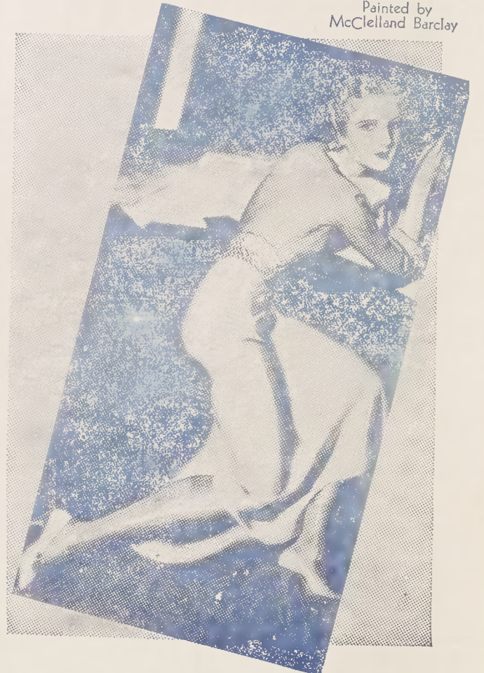
Painted by McClelland Barclay