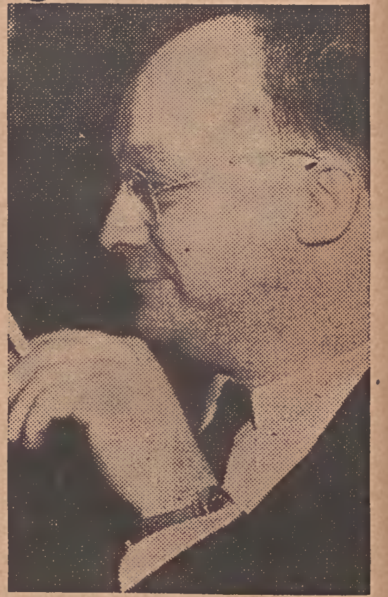
recently awarded the Guggenheim Fellowship. He plans to spend next year in Mexico City working on a novel.

For his outstanding work on "The Mind of the South" Mr. Cash was