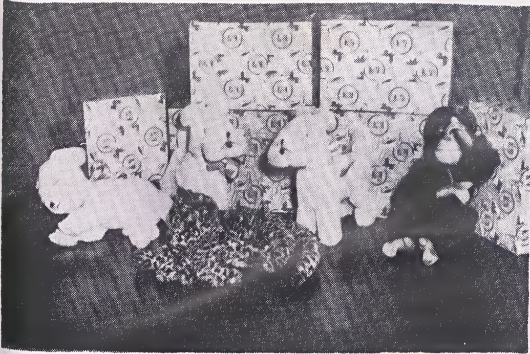
Fabrics produced at Caromount and Wilson Divisions are made into beautiful toys. The picture above shows a sleeping dog, tigris and cub, two pups, and a monkey.