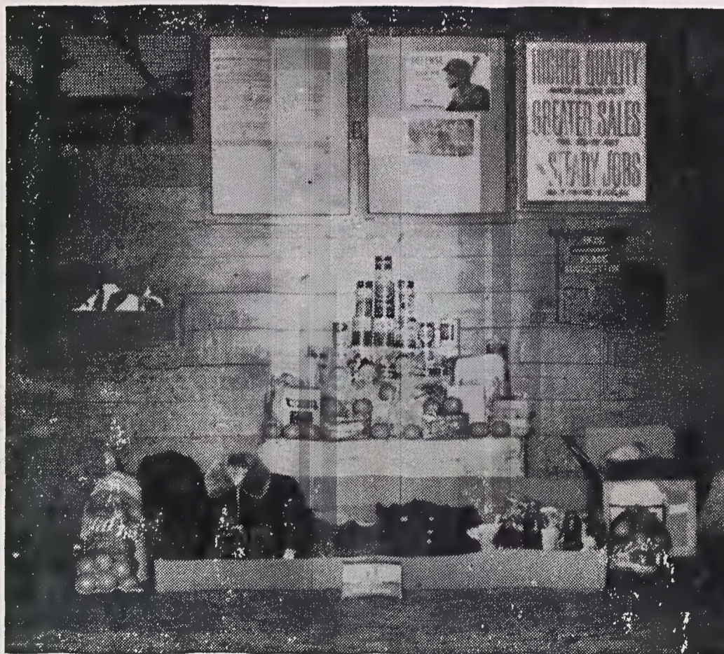
The fellows in the Machine Shop and Storeroom played Santa Claus to one of Rocky Mount's needy families. A large family suggested by the principal of Williford School was made happy by their generosity. Clothing, shoes, and groceries were contributed. A part of the contribution is shown above.