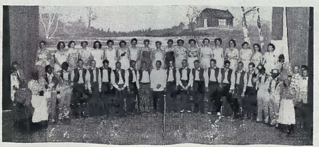
The entire company of The Variety and Ministrel Show is shown on the stage during one of their performances.