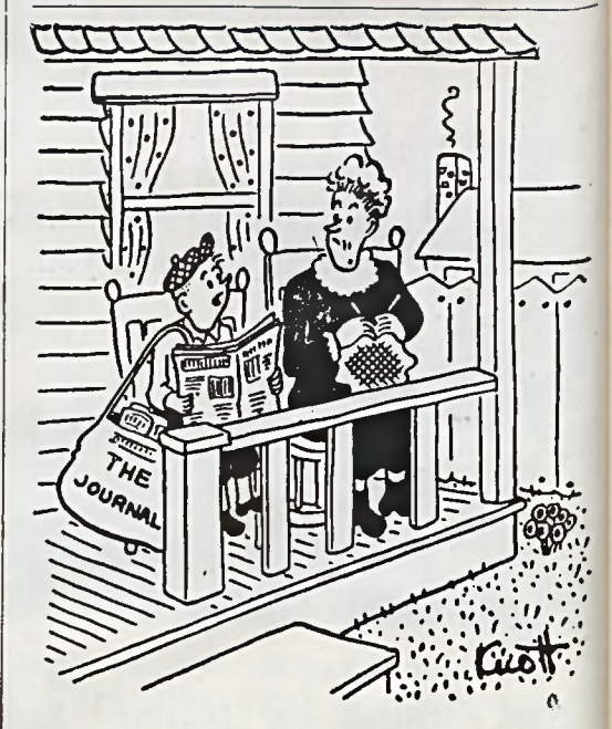
"When are you getting your glasses fixed, Mrs. Murdock? It takes up a lot of my time reading you the paper every day."

The real measure of our wealth is how much we should be worth if we lost our money.—J. H. Jowett.