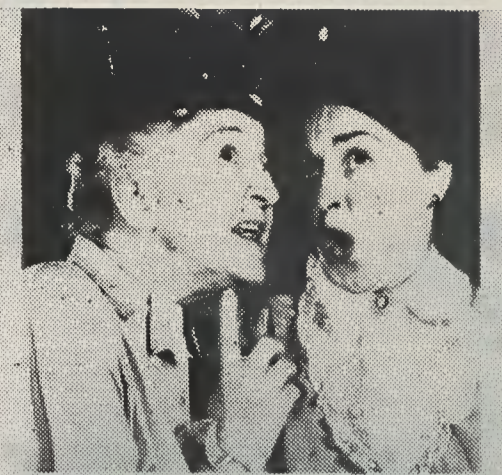
LET'S STOP RUMORS BEFORE THEY START...

Your Company's Prosperity is Your Best Security!