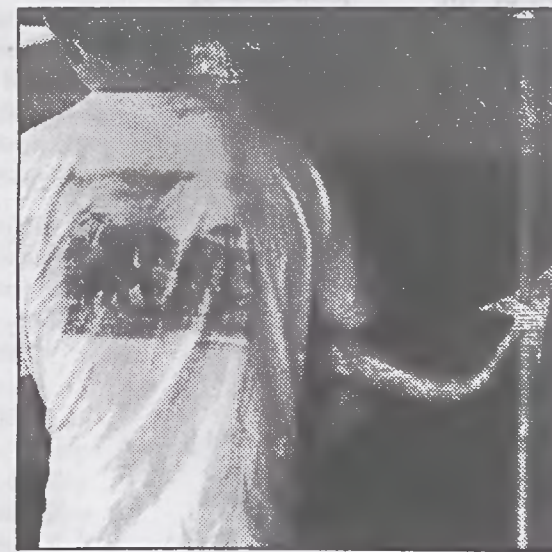
photographs by Dana Moore