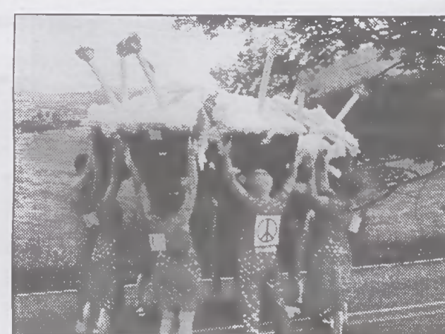
A memorable July 4 parade included this marching and dancing anniversary birthday cake.

Penland School of Crafts P. O. Box 37 Penland, North Carolina 28765-0037