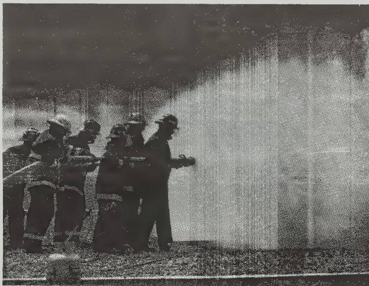
Firefighters from various county fire departments approach an LP Gas training fire held at the Fire and Rescue Training Facility located at JCC.

For more information on the State-wide Fire and Rescue College, you may contact Doug Fisher in Continuing Education at 934-3051, Ext. 281.