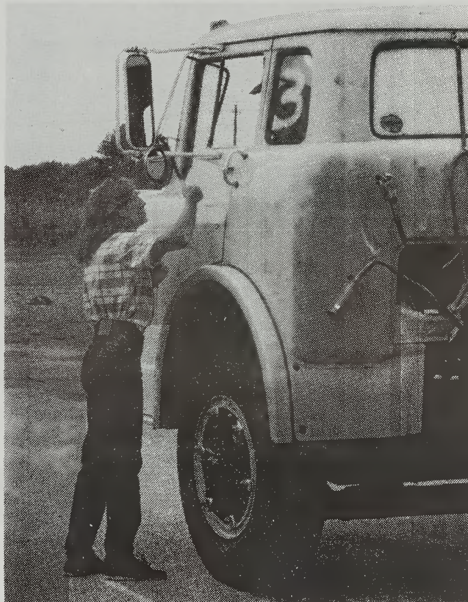
Cindy Marr tells a truck driving student to "cut that wheel sharply."