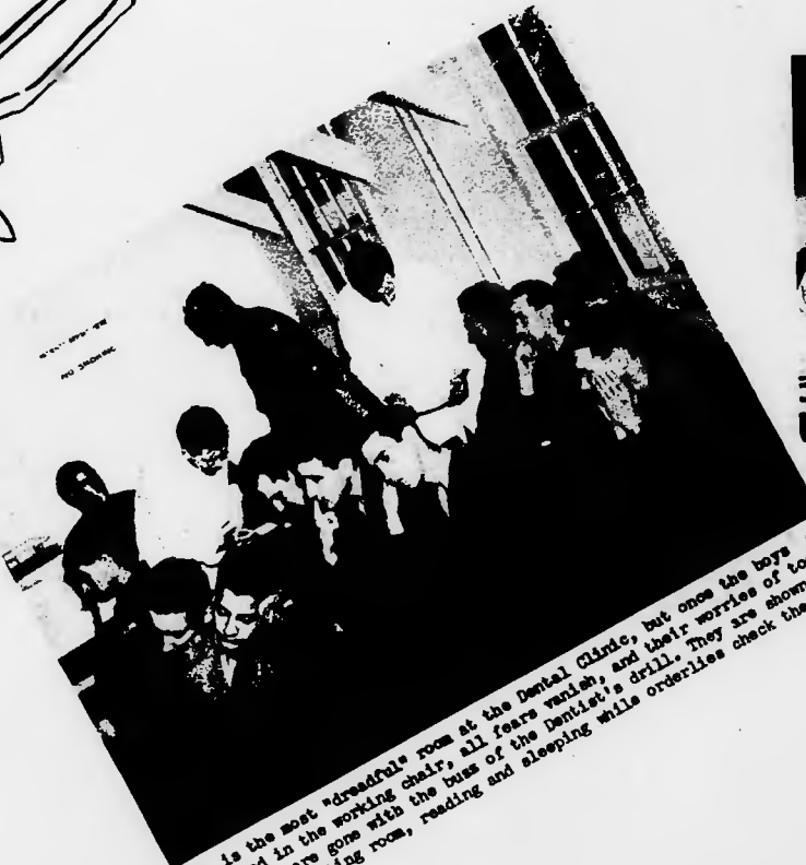
Here is the most "dreadful" room at the Dental Clinic, but once the boys get seated in the working chair, all fears vanish, and their worries of tooth-aches are gone with the buzz of the Dentist's drill. They are shown in the waiting room, reading and sleeping while orderlies check their charts.