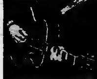
8 On shore he struts smoothly on his. (a) backslide (c) guitar (b) lunge (d) zipper