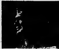
1 The head that rules the U. S. Army. (a) Air Forces (c) in Africa (b) Engineers (d) in Europe

Prepared by the Editors of LOOK Magazine