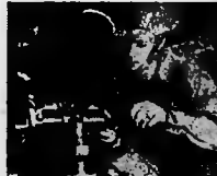
10 He'll lob at Nazis with his. (a) hand grenade (c) howitzer (b) blazer gun (d) mortar