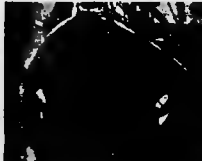
9 Down you see the destroyer's. (a) howdahs (c) poop holes (b) stinkholes (d) hatchets