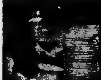
3 Work pits up for this unhappy. (a) fan dancer (c) taxi dancer (b) bubble dancer (d) gandy dancer