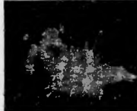
6 Men put on a Baby show with. (a) buckshot (c) tracer bullets (b) peashooters (d) dum-dum bullets