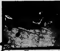
2 These were built especially for. (a) air-bombing (c) training (b) transport (d) observation