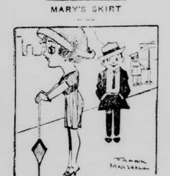
Mary had a little skirt That reached just to her knee— But then what interest could that have For chaps like you and me?