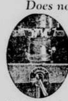
The Florence burner enables you to set the floor level on an uneven floor.

Notice the quality of the porcelain enamel and the sturdiness of the whole Florence Range. Ask the man in the store to point out to you the exclusive Florence features. This modern stove not only means a clean kitchen but is very attractive. Don't put off visiting a department, furniture or hardware store to examine the Florence Oil Range.