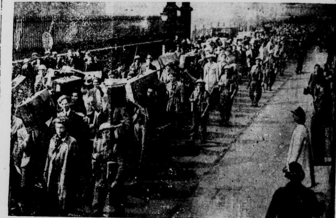
Files of armed soldiers escort this great parade of aliens to internment camps in a town in northern England as Britain rounds up thousands of men and women suspected of being in the "Fifth Column." Britain is taking no chances with aliens since German conquest of Norway and the Low Countries was materially assisted by Nazi sympathizers.

fertile soil, and (3), a balancing, entually make up for the loss of his family against economic disasof cash crops with livestock be foreign markets for farm produce ter. widely adapted in the State. but as Secretary Wallace has