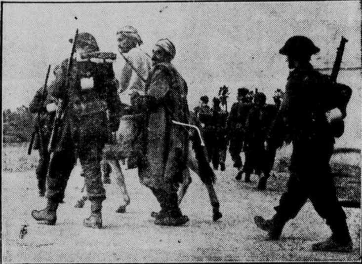
ALGERIAN NATIVE ARABS joke with British troops while showing them the way to the Maison Blanche airdrome. An entire British Army, under General Kenneth Anderson, landed in Algeria and is battling the Nazis in Tunisia.