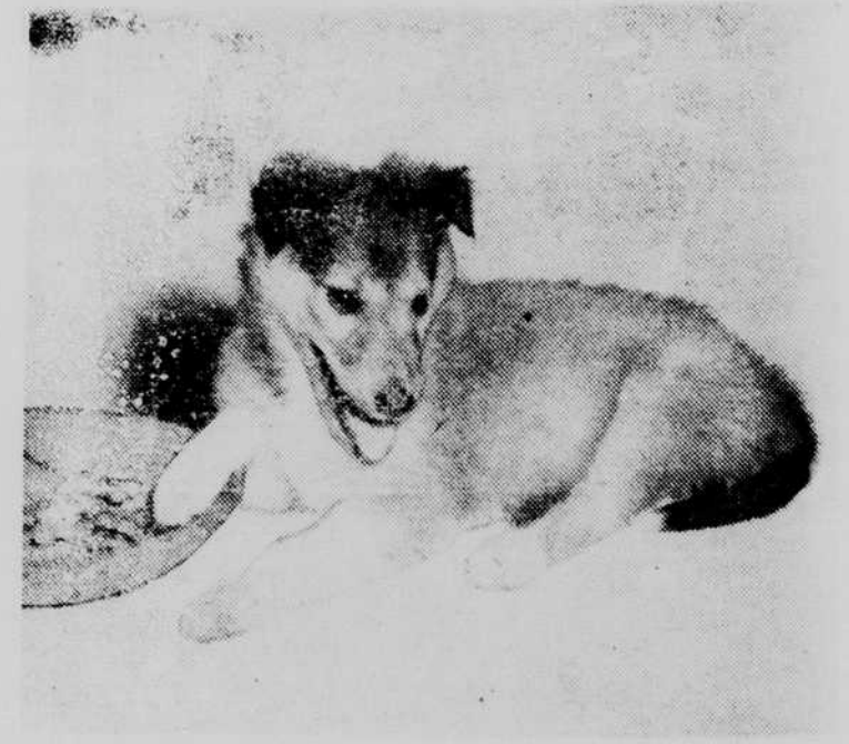
... SHOWN ABOVE IS