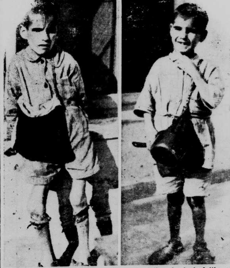
BEFORE—AND AFTER —For a long time he looked like a skeleton, haggard and hungry—but today, thanks to the aid of Greek War Relief, member agency of the National War Fund, he approaches normal health again.