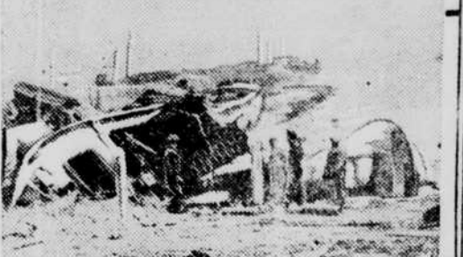
WRECKED — Allied airmen smashed these Nazi escape ships in the Dutch port of Breskens as Nazis tried to flee.