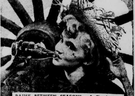
PAUSE BETWEEN SEASONS —A Thanksgiving party, with Nina Foch, Columbia actress, choosing a "Coke" to toast the ending of harvest and the coming of winter.