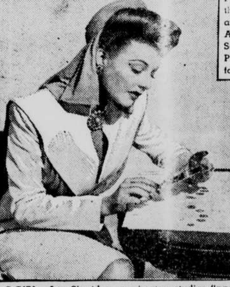
G-GIRL —Ann Sheridan, movie star, studies fingerprints for a hobby. If G-Man Hoover staffed his force of man hunters with Ann Sheridans, crooks certainly wouldn't run away from capture!