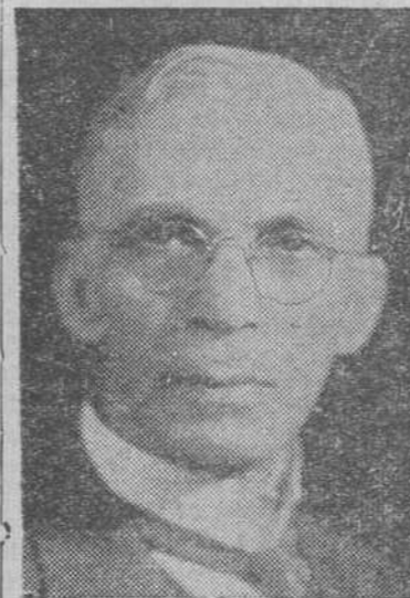
C. Smith University for forty years is dead. He died at the age of 88 following several weeks of illness.