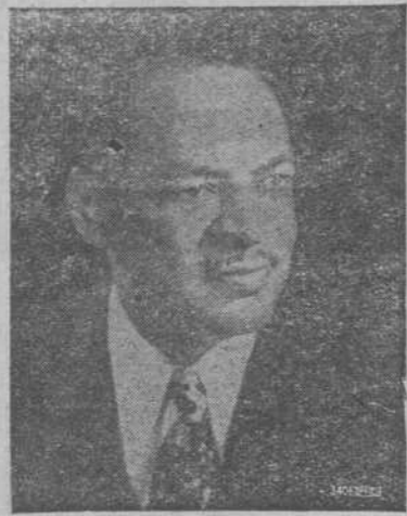
Congressman W. L. Dawson of the First Illinois District who will speak here Friday, July 27 in the third annual "Page One Award" of the Durham Press Club. The program will be held in the Hillside High School Auditorium.