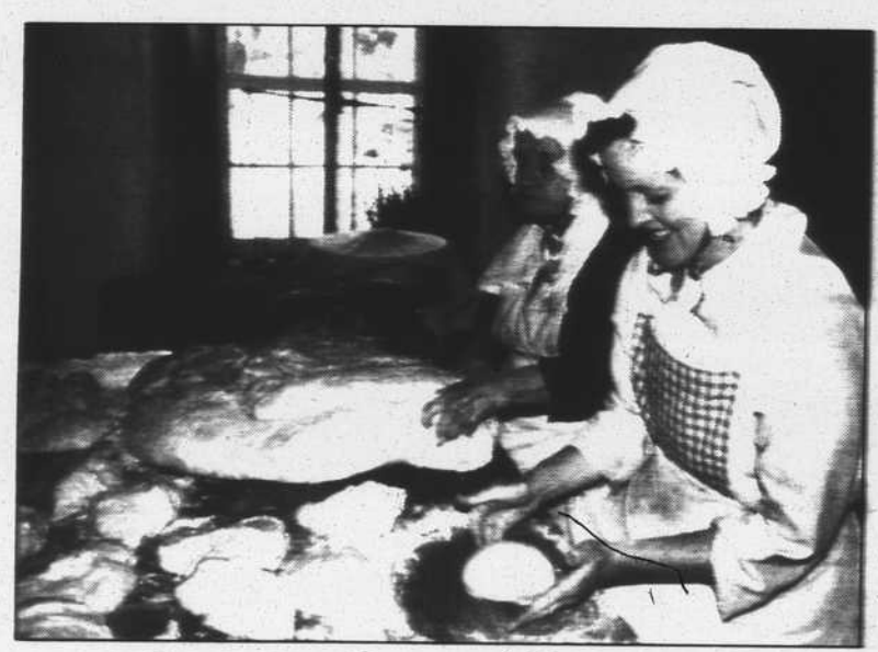
DEMONSTRATING the process of making bread.

WINSTON-SALEM - The Moravians who settled Salem in 1766 were known for hospitality. Iredell County residents have a special opportunity to experience that hospitality this Holiday season. Old Salem, located the in heart of Winston-Salem, is extending a first-time-ever invitation to residents of Iredell County to visit at a substantial discount during the