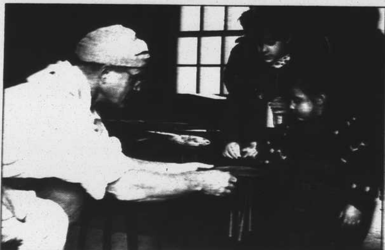
CHILDREN DISCOVER how to make Christmas candles.