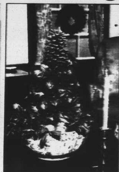
A CHRISTMAS apple tree

registration. Call 704-662-3337 if additional information is needed.