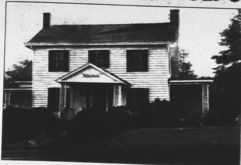
Vance House Museum

derful just to have Johnny come marching home?