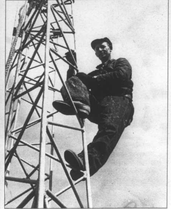
AN UNIDENTIFIED tower climber.