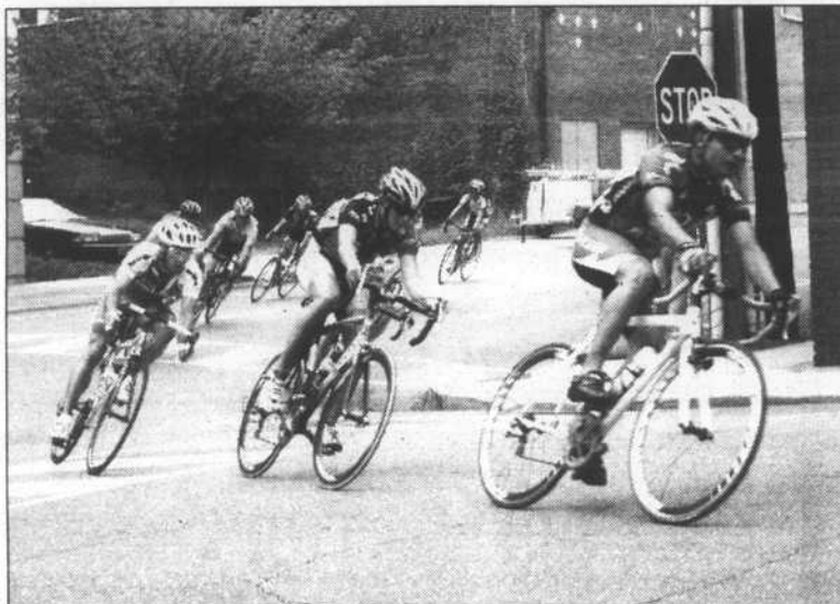
CATEGORY 2-3 BICYCLISTS TURN onto Court Street during the Statesville Criterium.