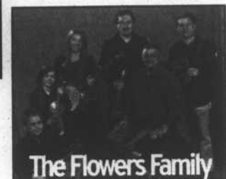
The Flowers Family